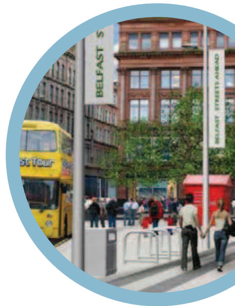
Belfast's Streets Ahead Project

The aims of such improvements will only be achieved through co-ordinated activity between local authorities, public bodies and private interests. It is vital businesses are given a key role in ensuring public funds are spent wisely to ensure the maximum long-term benefit.