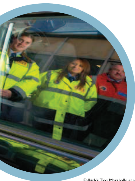
Falkirk's Taxi Marshalls at work

Problems associated with alcohol-related disorder can also have extremely serious implications for High Streets. Experience has shown this to be a multi-faceted problem that needs concerted action by the police, trading standards, retailers and pubs and clubs to reduce problems associated with the night-time economy.