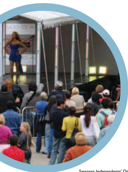
Swansea Independents' Day