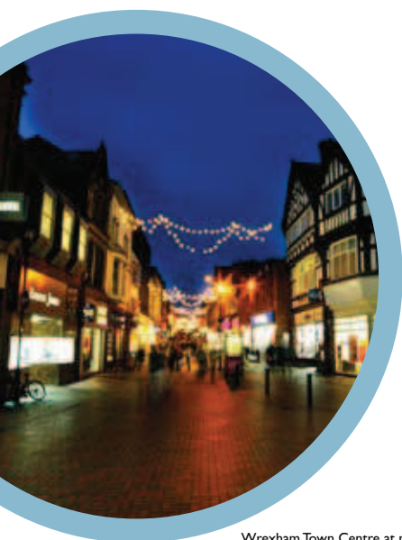
Wrexham Town Centre at night