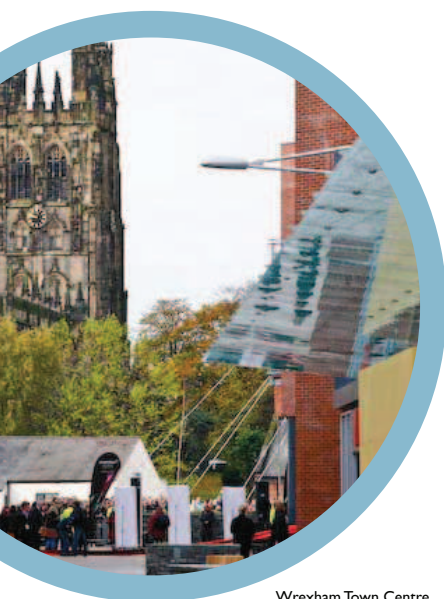
Wrexham Town Centre

The new development was opened in October 2008 and is currently 90% let. Six months after opening the town centre is vibrant and busy with high footfall and spend. A number of new businesses have opened in premises vacated following relocations.